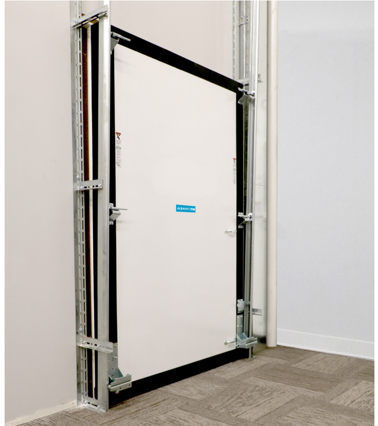
Representative image only

4Front Engineered Solutions reserves the right to change specifications and designs without notice and without incurring obligations.